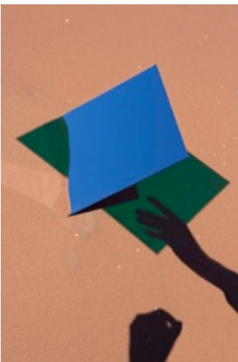
Image 3 Viviane Sassen Axiom GBO1 , from the series Axiom , 2014