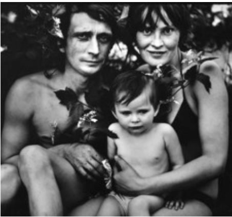
Image 1 Nikolai Bakharev No. 14 , from the series Relation , 1980 Gelatin Silver print ©MAMM, Moscow / Nikolai Bakharev Collection of the Moscow House of Photography Museum