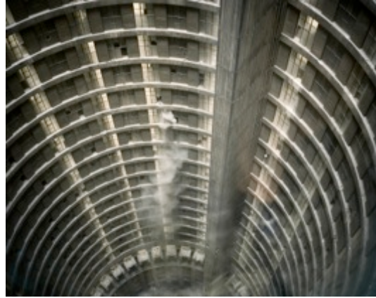
Image 6 Mikhael Subotzky & Patrick Waterhouse Untitled #1, Ponte City Johannesburg , from the series Ponte City , 2008 © Mikhael Subotzky / Patrick Waterhouse Courtesy Goodman Gallery