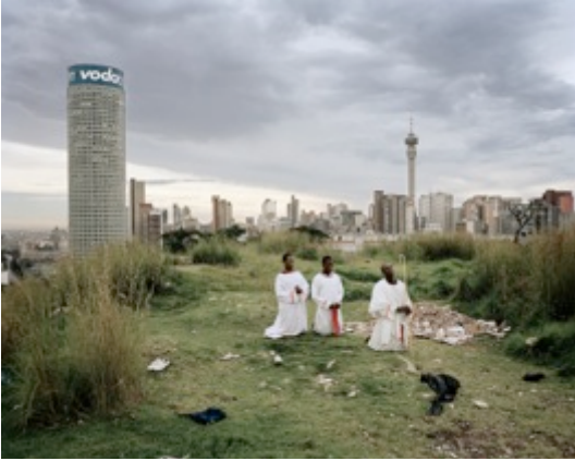
Image 5 Mikhael Subotzky & Patrick Waterhouse Ponte City from Yeoville Ridge , from the series Ponte City , 2008 © Mikhael Subotzky / Patrick Waterhouse Courtesy Goodman Gallery