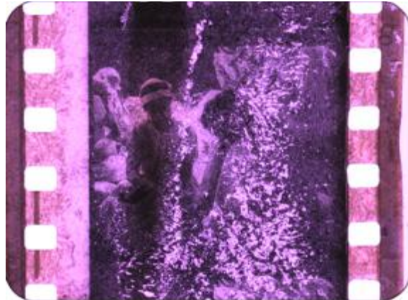
Image 8 Zineb Sedira Mise-en-scène , 2019