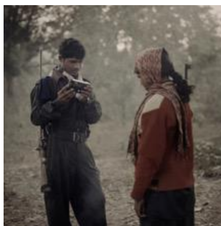
Image 2 Poulomi Basu From Centralia , 2020