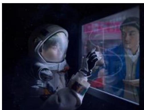
Image 4 Cao Fei Nova , 2019 © Cao Fei Courtesy of artist, Vitamin Creative Space and Sprüth Magers