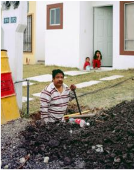
Image 5 Alejandro Cartagena Man digging a hole from A Small Guide to Homeownership , 2020