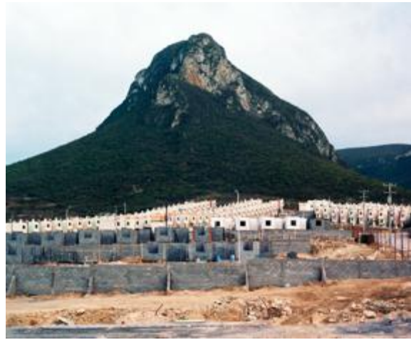
Image 6 Alejandro Cartagena Escobedo from A Small Guide to Homeownership , 2020