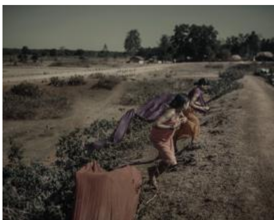
Image 1 Poulomi Basu From Centralia , 2020

DEUTSCHE BÖRSE PHOTOGRAPHY FOUNDATION PRIZE 2021 19 MARCH – 27 JUNE 2021