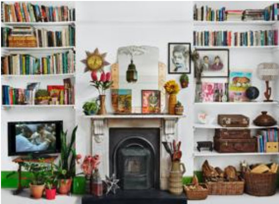
Image 7 Exhibition view Zineb Sedira, A Brief Moment/L'espace d'un instant , 2019 © Zineb Sedira Photo: Archive kamel mennour