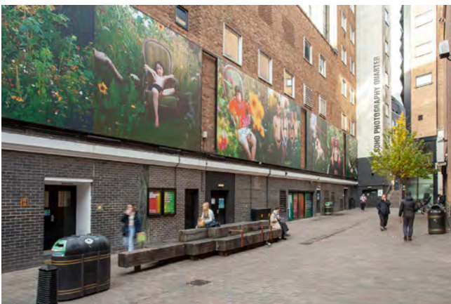
Installation photograph of Siân Davey: The Garden exhibition in Soho Photography Quarter Alt: Photograph of an art frieze by Siân Davey on a building with people sat on a bench and walking past the works.