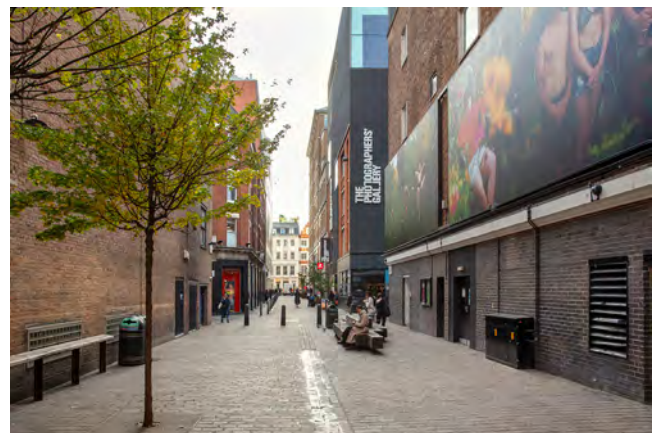
Installation photograph of Siân Davey: The Garden exhibition in Soho Photography Quarter Alt: Photograph of an art frieze by Siân Davey on a building, The Photographers' Gallery is seen in the distance.