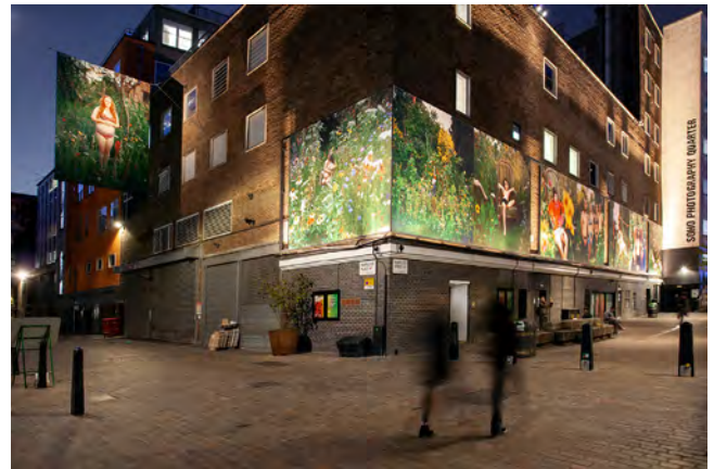
Installation photograph of Siân Davey: The Garden exhibition in Soho Photography Quarter Alt: Night photograph of an illuminated art frieze by Siân Davey on a building with people walking past.