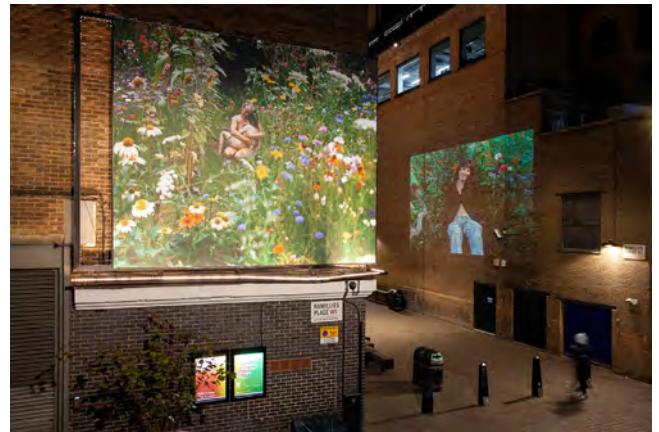
Installation photograph of Siân Davey: The Garden exhibition in Soho Photography Quarter Alt: Night photograph of an art frieze by Siân Davey on the corner of a building with a film projection on the opposite building.