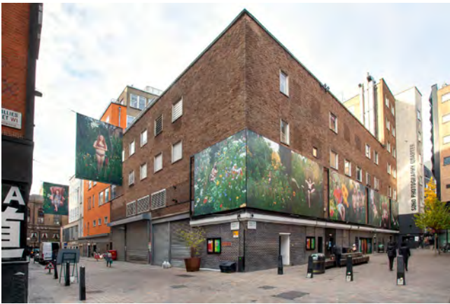
Installation photograph of Siân Davey: The Garden exhibition in Soho Photography Quarter Alt: Photograph of an art frieze by Siân Davey on a building with two banners across two buildings in the distance.