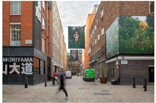
Installation photograph of Siân Davey: The Garden exhibition in Soho Photography Quarter Alt: Photograph of two banners by Siân Davey tied between two buildings with a blurred figure walking past.