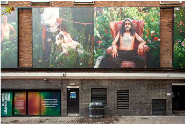
Installation photograph of Siân Davey: The Garden exhibition in Soho Photography Quarter Alt: Daytime photograph of an art frieze by Siân Davey on a building.