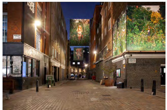
Installation photograph of Siân Davey: The Garden exhibition in Soho Photography Quarter Alt: Night photograph of two banners by Siân Davey tied between two buildings on a quiet street.