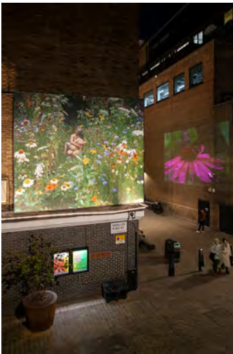
Installation photograph of Siân Davey: The Garden exhibition in Soho Photography Quarter Alt: Night photograph of an art frieze by Siân Davey on the corner of a building with a film projection on the opposite building. People walk past on the street below.

Soho Photography Quarter - Siân Davey: The Garden November 2023 – November 2024