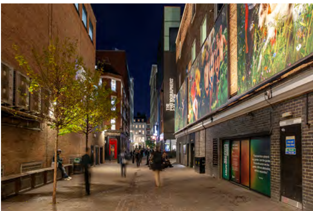
Installation photograph of Siân Davey: The Garden exhibition in Soho Photography Quarter Alt: Night photograph of the corner of an art frieze by Siân Davey on a building with people walking past.