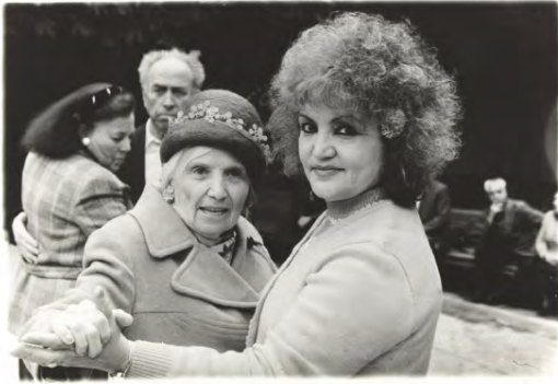
From the series "Dance", 1978 © Boris Mikhailov, VG Bild-Kunst, Bonn, Courtesy Boris and Vita Mikhailov

Alternative Text: Black and white photograph of a woman and an older woman holding hands as they dance together. An older couple can be seen in the background.