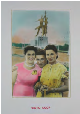
From the series "Luriki" (Coloured Soviet Portrait), 1971-85.

Alternative Text: Blue toned photograph of the side profile of a man wearing a winter hat and coat standing in the middle of a snowy road.