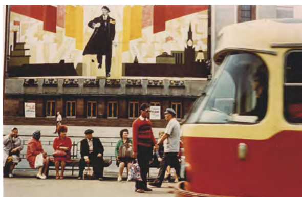
From the series “Red”, 1968-75.

Alternative Text: Colour photograph of an unidentifiable person wearing a red coat and red hat crouching down and a man wearing a winter coat and hat holding luggage. A black dog can be seen at the back of the photo.