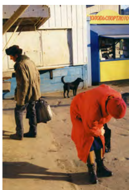
From the series “Case History”, 1997-98.

Alternative Text: Colour photograph of a young man posed in green army uniform in front of a pink backdrop.