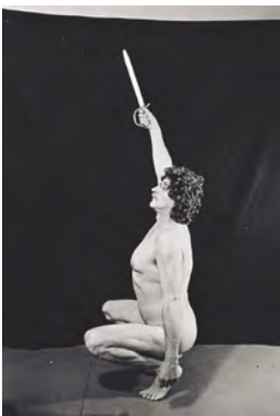
From the series "I am not I", 1992 © Boris Mikhailov, VG Bild-Kunst, Bonn. Courtesy Boris and Vita Mikhailov

Alternative Text: Colour photograph of three women posing with a monument featured in the background. Two of the women can be seen in a pink dress and a yellow dress.