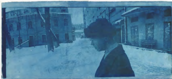
From the series "At Dusk", 1993

Alternative Text: Black and white photograph of a woman and an older woman holding hands as they dance together. An older couple can be seen in the background.