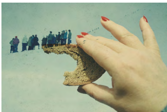
From the series “Yesterday’s Sandwich”, 1960s-1970s © Boris Mikhailov, VG Bild-Kunst, Bonn, Courtesy Boris and Vita Mikhailov

Alternative Text: Colour photograph of people sat on a bench with a large billboard of Vladimir Lenin behind. A tram can be seen in the corner passing in front.