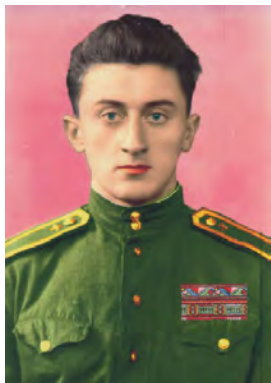
From the series “National Hero”, 1991 © Boris Mikhailov, VG Bild-Kunst, Bonn, Courtesy Boris and Vita Mikhailov

Alternative Text: Colour photograph of a young man posed in green army uniform in front of a pink backdrop.