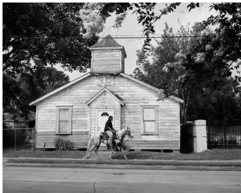
Untitled Cowboy (Acres Homes), Houston, Texas, 2022.

Alternative Text: Black and white photograph of a man riding a horse past a house on the street.