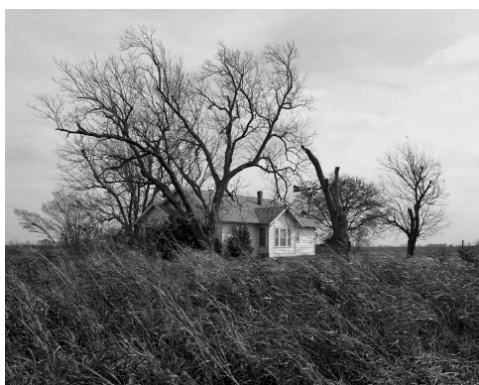
Windmill House, Hutto, Texas, 2022.

Alternative Text: Black and white photograph of three women, wearing white dresses. They have their heads bent down with their arms outstretched.