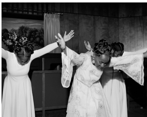
Praise Dancers, Edna, Texas, 2022.

Alternative Text: Black and white photograph of a man riding a horse past a house on the street.