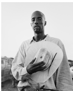
Praying Cowboy, Gladewater Texas, 2021.

Alternative Text: Black and white photograph of a house in the distance, surrounded by bare trees.