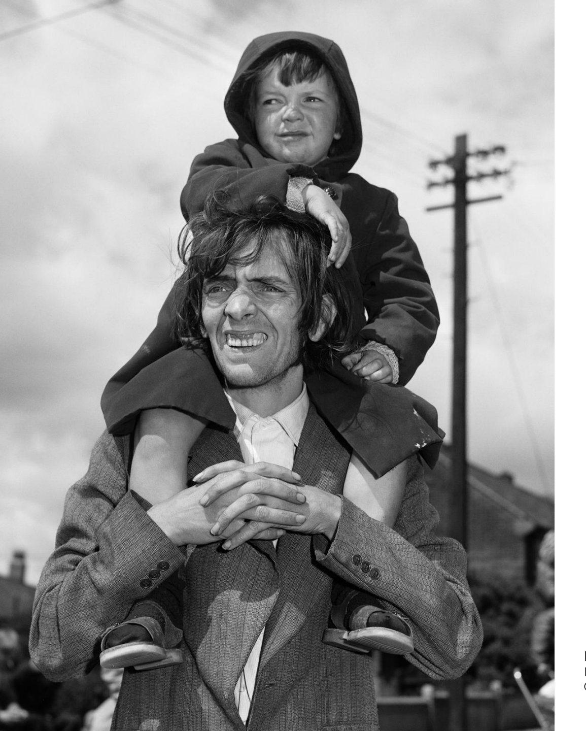
IMAGE 1 Father and son watching a parade, West-end of Newcastle, Tyneside, 1980