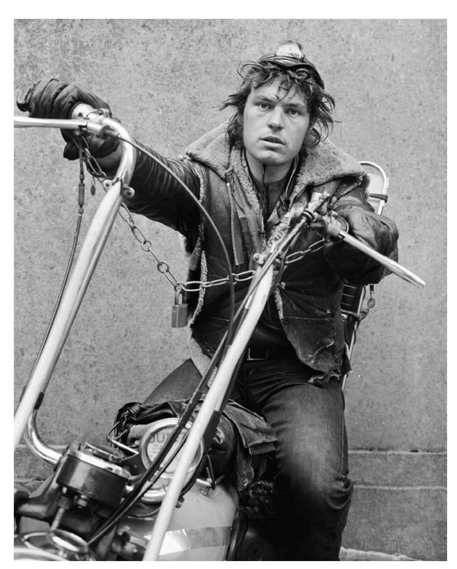
IMAGE 5 TT Races Supporter, Isle of Man, 1971