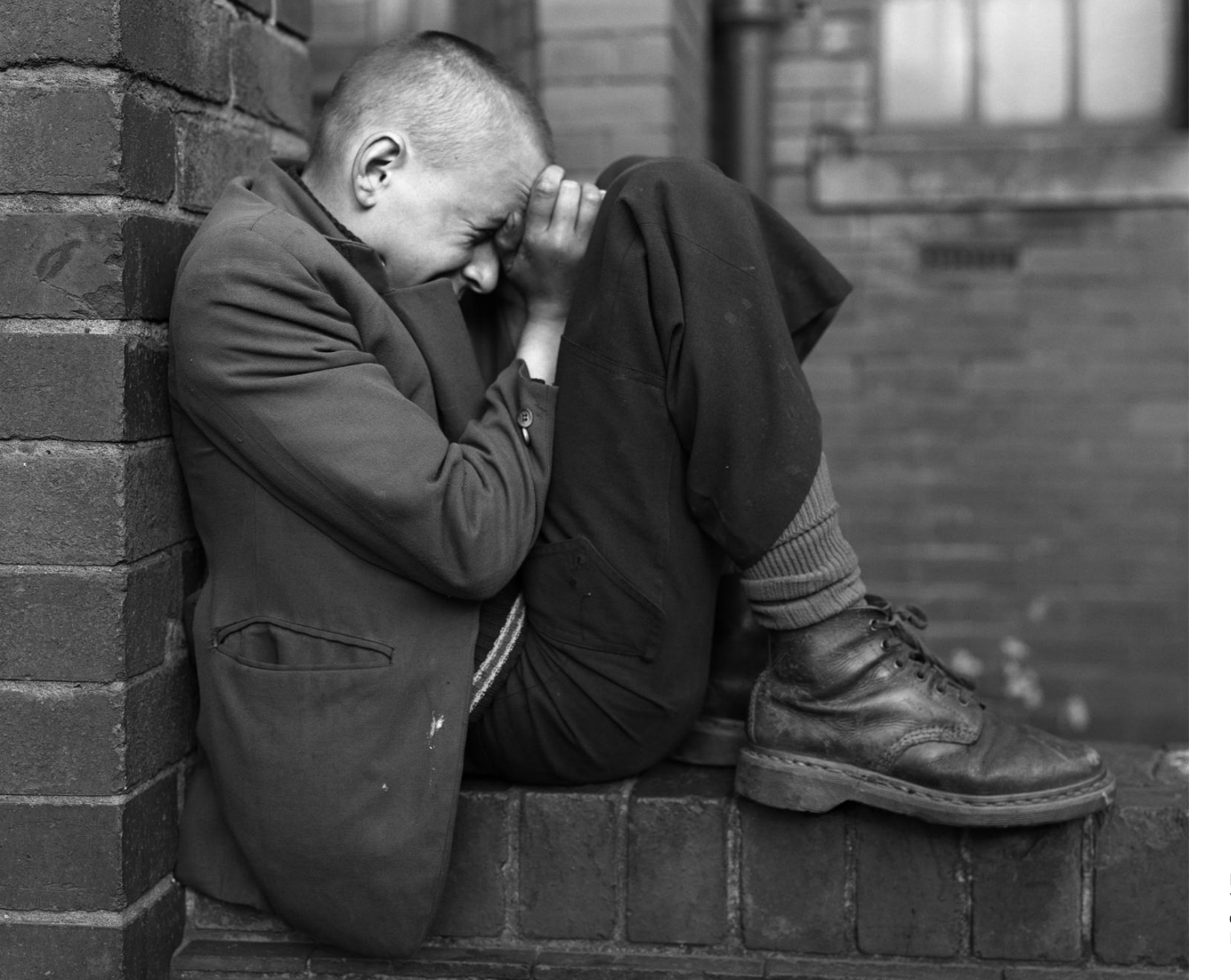
IMAGE 8 Youth on wall, Jarrow, Tyneside, 1975