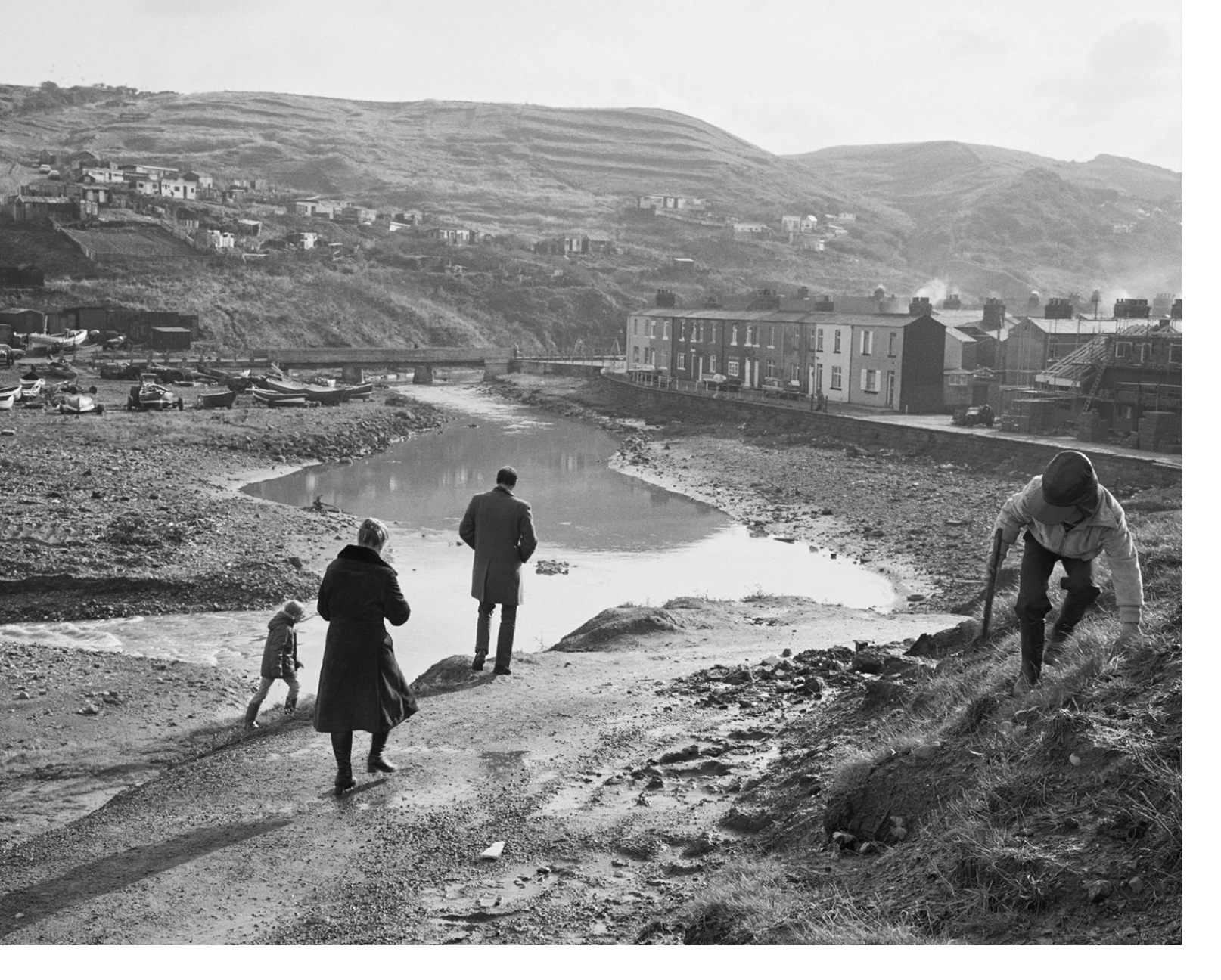
IMAGE 11 Family on a Sunday walk, Skinningrove, 1982