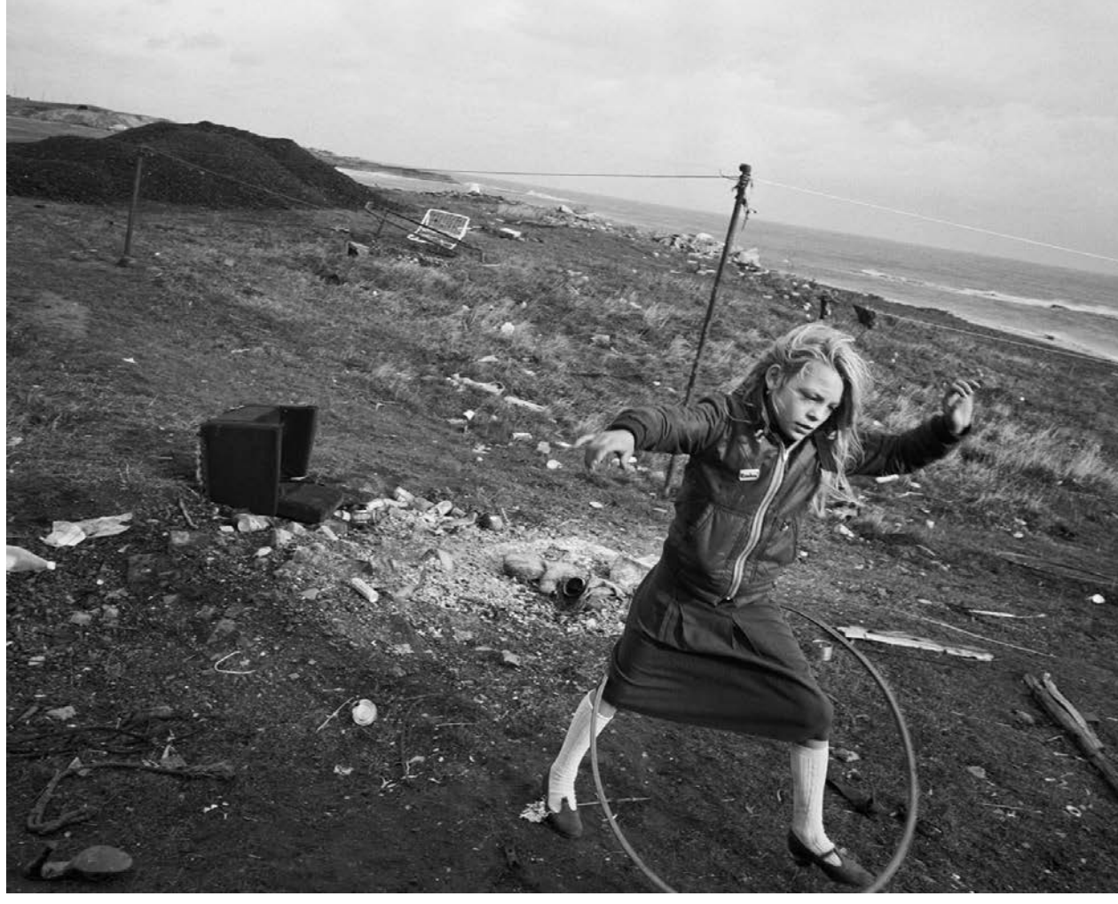
IMAGE 6 Bever, Skinningrove, N. Yorkshire, 1983