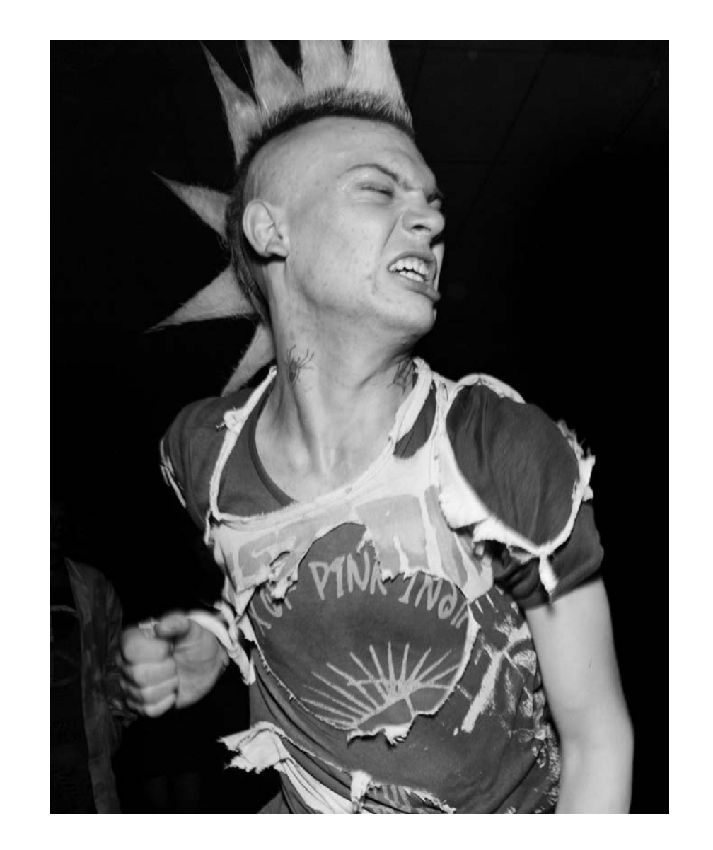
IMAGE 4 The Station, Gateshead, 1985