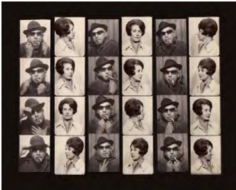
"French Couple", Six Strips, France, 1960s

Alt text: Photograph of six monochrome photograph strips of a man wearing a hat and sunglasses with a cigarette in his mouth and a woman in a light-coloured coat posing individually in the photobooth.