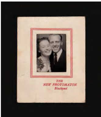
"Couple", Photomaton, Blackpool, England, 1950s

Alt text: Photograph of six monochrome photograph strips of a man wearing a hat and sunglasses with a cigarette in his mouth and a woman in a light-coloured coat posing individually in the photobooth.