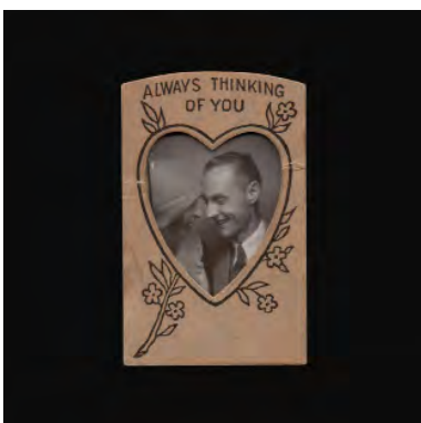
"Always thinking of you", United States of America, 1930s

Alt text: Photograph of a folded card featuring a passport sized photo of a woman. The identity card comes from the "Société continentale de Photographie" (Continental Photography Society).