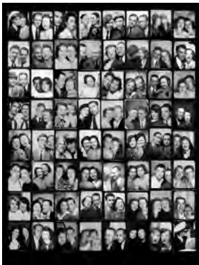
"Couples" , circa 1930s-1950s

Alt text: Black and white photobooth strip of a man posing for the camera.