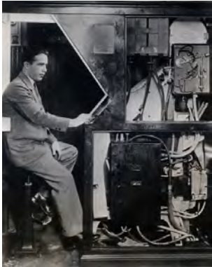
"Portrait of Anatol Josepho in his Photomaton", United States of America, 1927

Alt text: Black and white photograph of a man sat inside a photobooth. The side of the photobooth has its cables and wiring exposed.