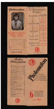
Photomaton Pochette, France, circa 1930s-1950s

Alt text: Photobooth portrait of a couple smiling for the camera. The picture is enclosed inside a 'The New Photomaton Blackpool' frame.