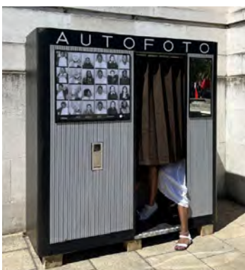
Autofoto © Courtesy Autofoto

Alt text: Collage of different photobooth portraits, some of which are in colour, some of which are black and white.