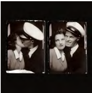
"Couple", circa 1930s-1950s

Alt text: Black and white photograph of a man sat inside a photobooth. The side of the photobooth has its cables and wiring exposed.