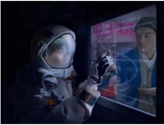
Image 11 Cao Fei Nova , 2019 © Cao Fei Courtesy of artist, Vitamin Creative Space and Sprüth Magers