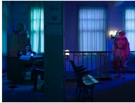
Image 12 Cao Fei Nova , 2019 © Cao Fei Courtesy of artist, Vitamin Creative Space and Sprüth Magers