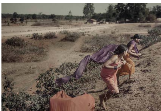
Image 1 Poulomi Basu From Centralia , 2020 © Poulomi Basu Courtesy of the artist

DEUTSCHE BÖRSE PHOTOGRAPHY FOUNDATION PRIZE 2021 25 JUN – 26 SEPT 2021