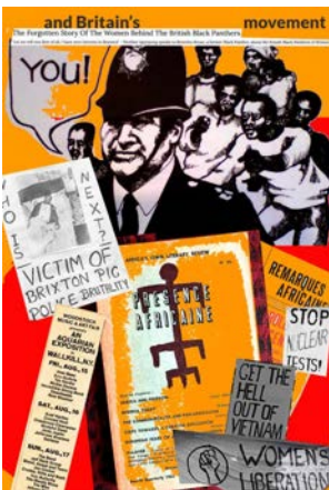
Image 15 For a Brief Moment the World was on Fire , 2019 Exhibition: A Brief Moment , Jeu de Paume, Paris, France