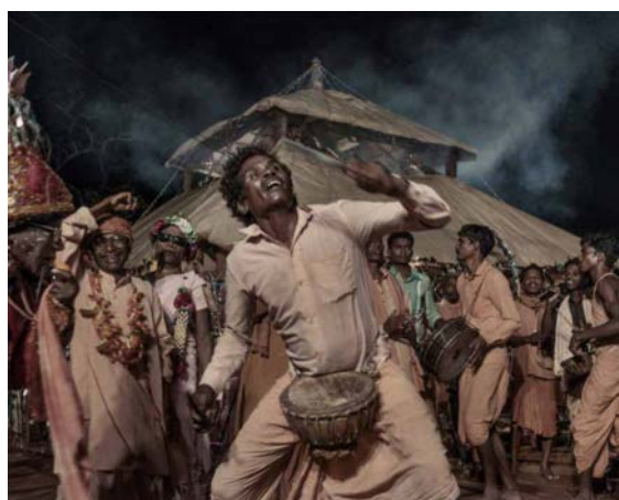
Image 2 Poulomi Basu From Centralia , 2020