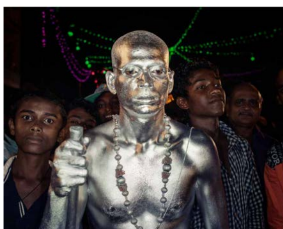
Image 4 Poulomi Basu From Centralia , 2020