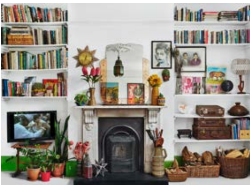
Image 13 Zineb Sedira Way of Life , 2019 Exhibition: A Brief Moment , Jeu de Paume, Paris, France © Zineb Sedira Courtesy of the artist and Kamel Mennour, Paris NB. The installation will be recreated at The Photographers' Gallery for the exhibition