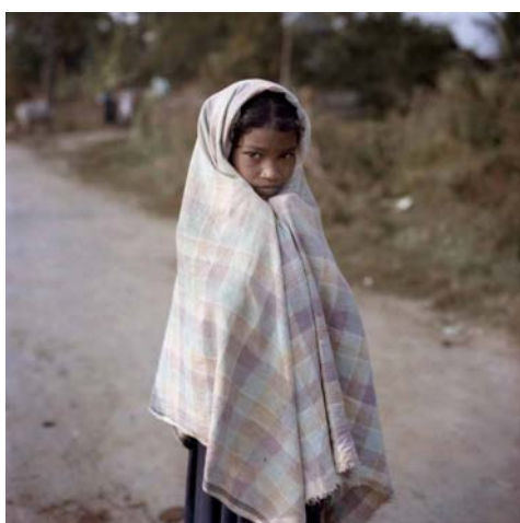
Image 3 Poulomi Basu From Centralia , 2020 © Poulomi Basu Courtesy of the artist