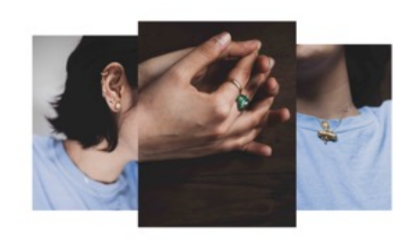
Image 19 Wild Fox What You Wear Is Who You Are From the series What You Wear Is Who You Are, 2019