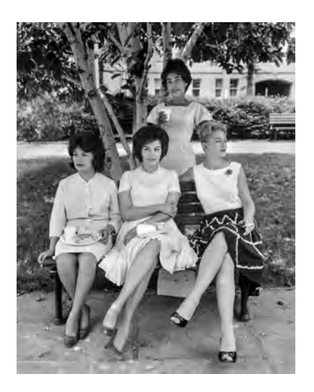
Secretaries in Rawlings Park, Washington, 1965