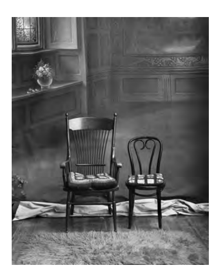
Two Chairs, London, 1975