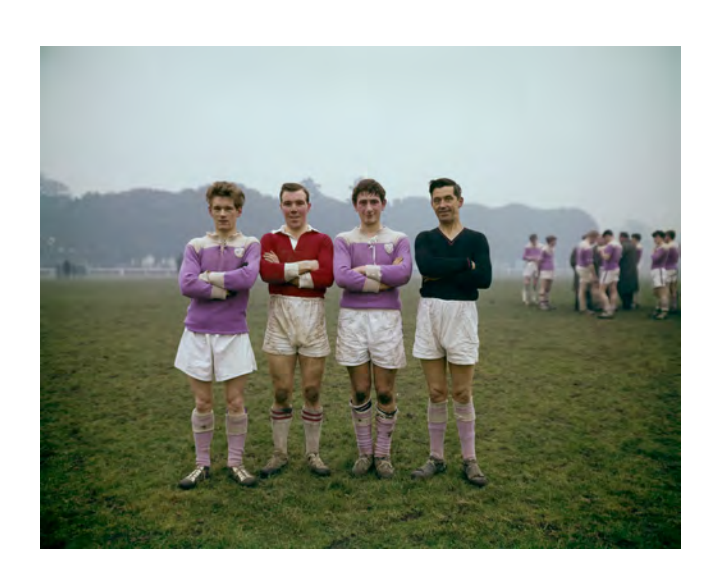
Phoenix Park on a Sunday, Dublin, 1966