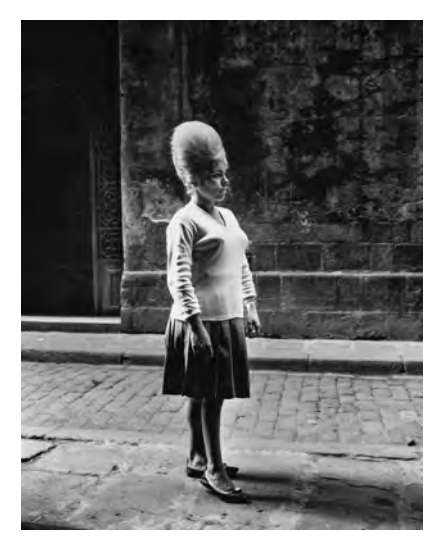
Girl, Barcelona, 1963