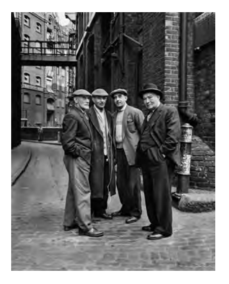
Warehousemen and Foreman, London, 1962