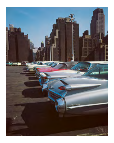
Car Park, New York, 1965