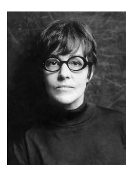
Self-Portrait, New York, 1960s