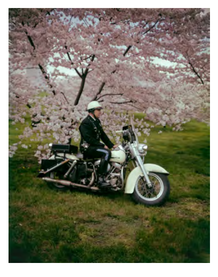
Springtime, Washington, 1965