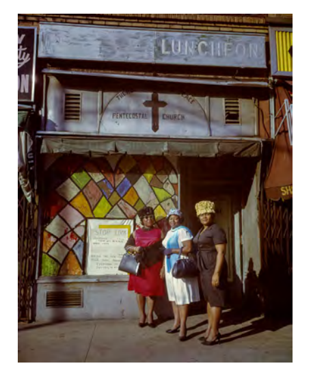
Harlem Church, New York, 1964