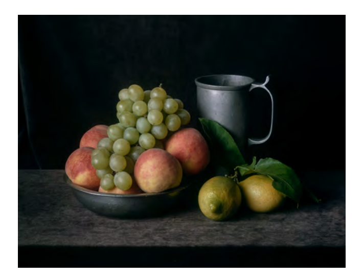
Pewter Pitcher with Grapes (Still Life No. 7), New York, 1997