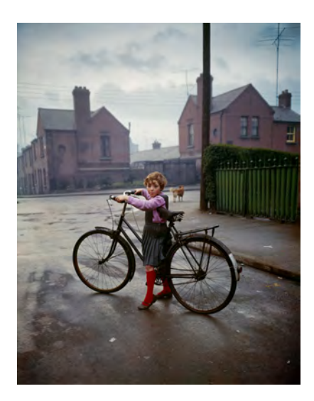
Girl with Bicycle, Dublin, 1966 © Estate of Evelyn Hofer Courtesy Galerie m, Bochum, Germany