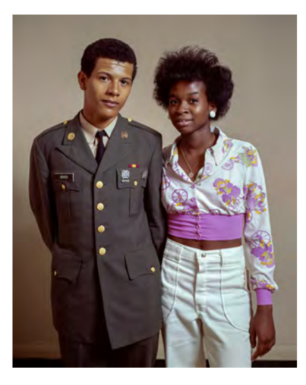
Soldier in Uniform with Girlfriend, New York, 1974