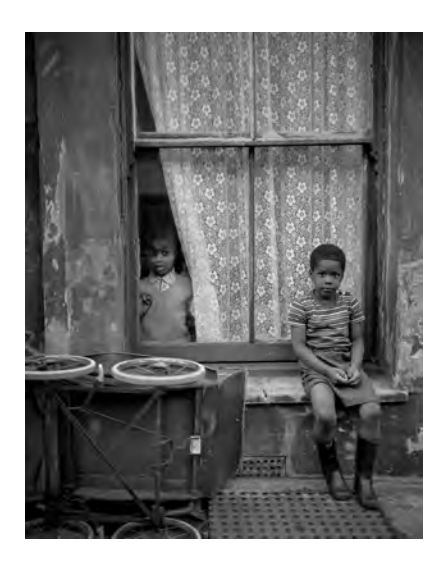
Notting Hill Gate, London, 1962