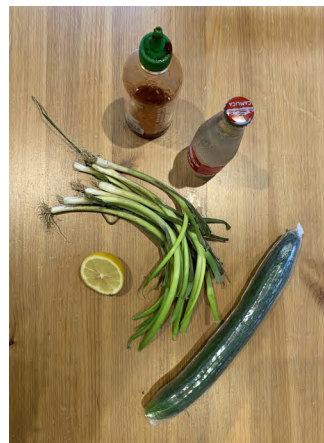
Photograph 3: Contents in your fridge