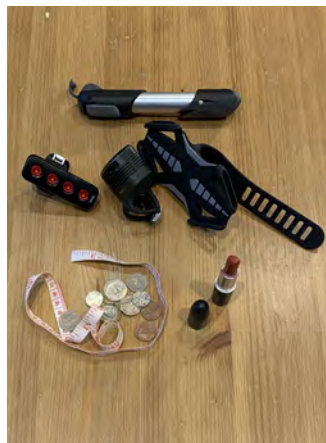
Photograph 2: Contents of your bag or rucksack