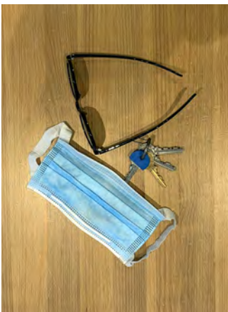
Photograph 1: Contents of your pockets