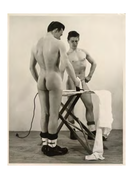
Basil Clavering, (Royale), Storyette EX FJSS print, 1950s