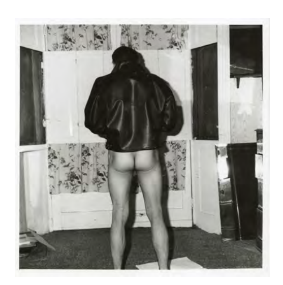
Anonymous, The Portobello Boys, early 1960s