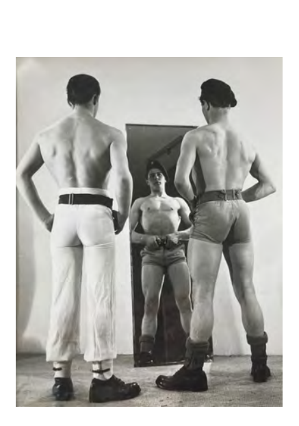
Basil Clavering, (Royale, Hussar, Dolphin), Mail order Storyette print, late 1950s